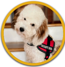
NOODLES CLAY COUNTY