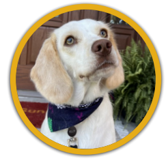
WILLOW HARRISON COUNTY