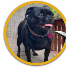
NUTMEG HARRISON COUNTY