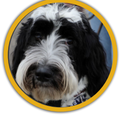
OLLIE CABELL COUNTY