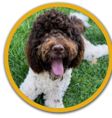
COCOA HARRISON COUNTY